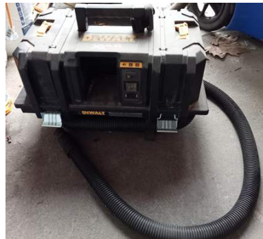
Dewalt Vacuum / Dust Extraction System